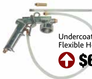
Undercoating gun with Flexible Hose