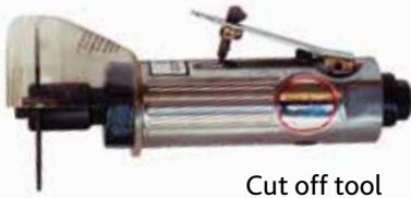
Cut off tool

Body saw. Ideal for muffler & body shop repairs